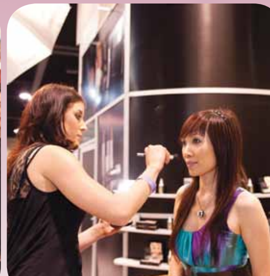
Youngblood Mineral Cosmetics floor demo