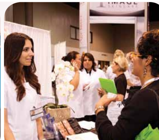
Image Skincare booth