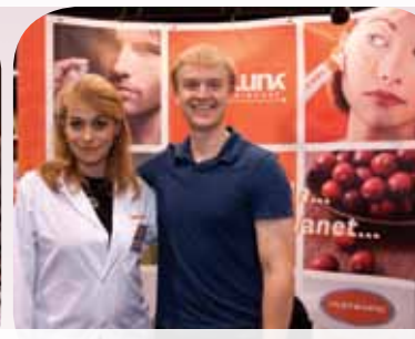
Yum Gourmet Skincare