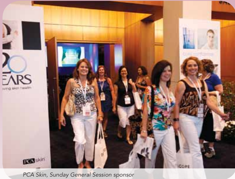
PCA Skin, Sunday General Session sponsor