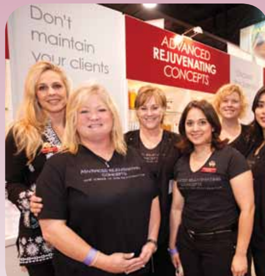
Advanced Rejuvenating Concepts team