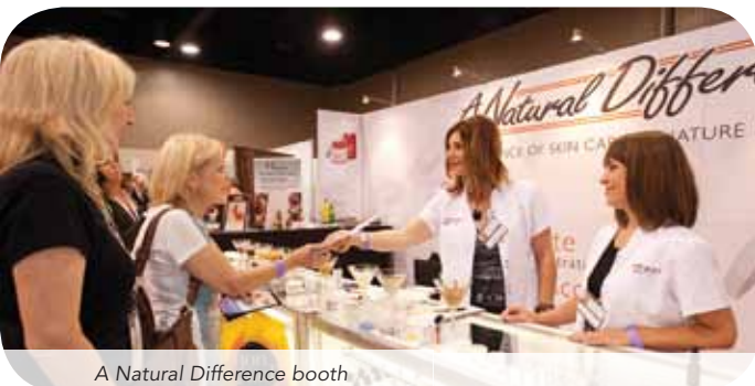
A Natural Difference booth