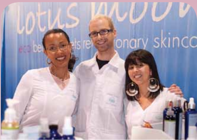
Lotus Moon team