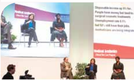
Medical Esthetic Seminar