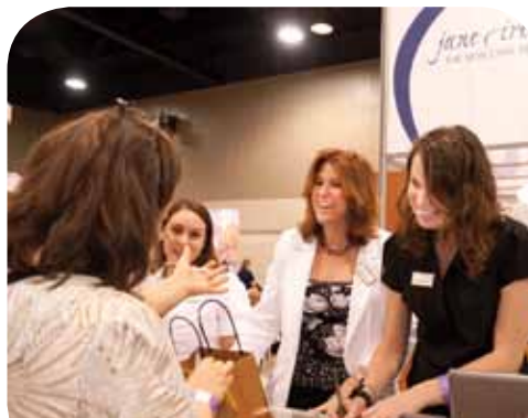
Jane Iredale booth