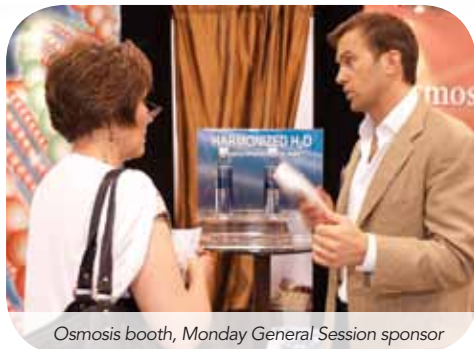
Osmosis booth, Monday General Session sponsor