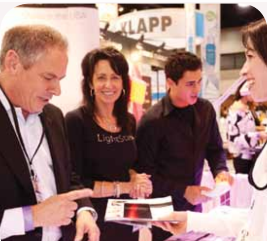
LightStim International booth